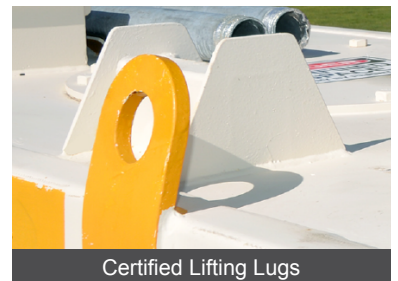
Certified Lifting Lugs